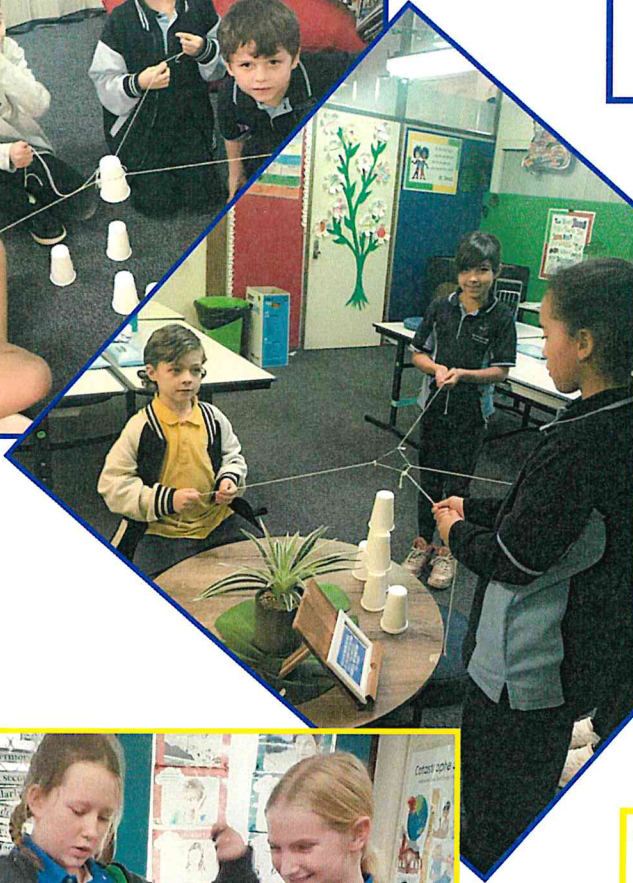
Room 16, Year 3 building their "You Can Do It!" skills with a little teamwork!